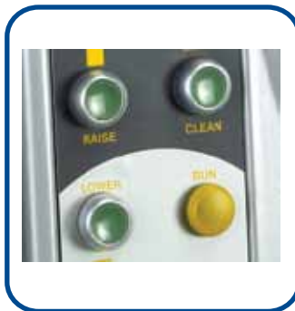
R20 Control Panel

In line with policy to continually develop and improve its products, Moffat reserves the right to change specifications and design without notice.