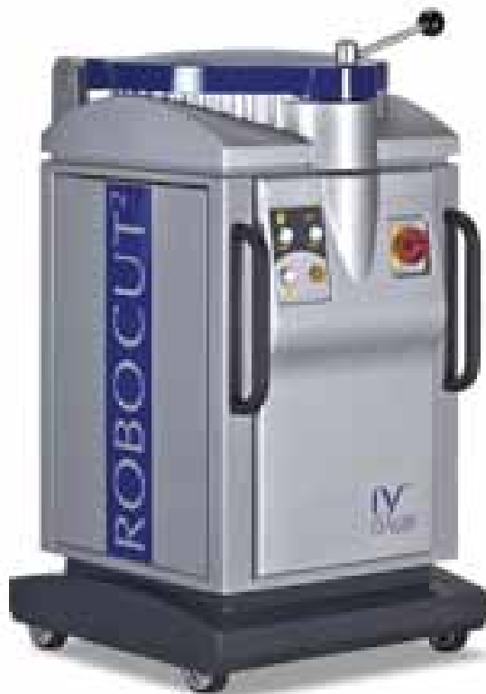
Robocut2 - R20