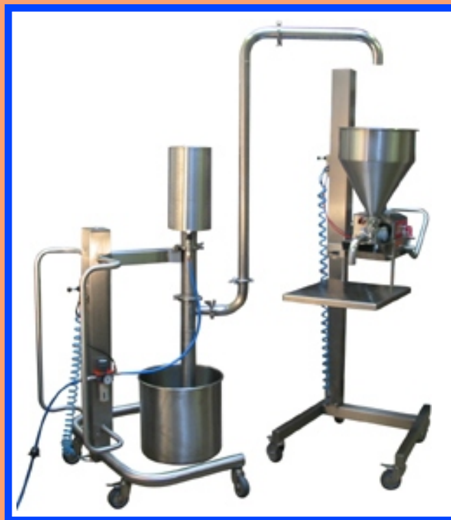
Note: Image shows PUMP1050 Transfer Pump and DEP5-670 Depositor